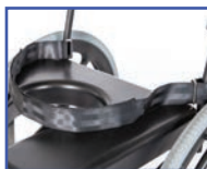
PW60884 Waist Belt (for 20\"/>