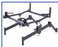
P13722 20"Wx18"D Stainless Steel Frame