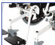
PL13725 Left Leg Rest