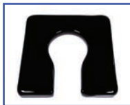
P60850* 18"Wx18"D Ensolite® 1" waterfall foam Front/Rear Open Seat A5"xB-8" opening