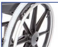
P13857 24" PVC Handrims (replaces standard handrims, pair)