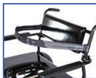
PT60884 Trunk Belt (64\", 66\"/>