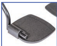
P13892 Right Oversized Aluminum Foot Plate