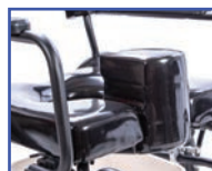
P61006 Abductor/Deflector Large