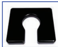
P61038 20"Wx18"D Comfortuff 1.5" waterfall foam Front Open Seat A-5"xB-8" opening