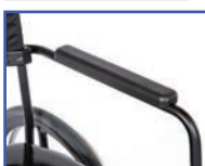
P13715 Left Hand Armrest with Pad