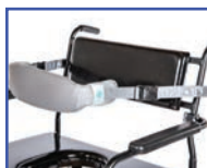
P11112 Bodypoint® XL Trunk Belt