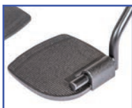
P13891 Left Oversized Aluminum Foot Plate