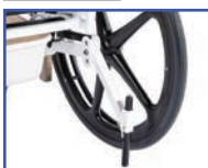
P13708 Bolted Axles with Tipping Levers (pair)