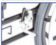
P60532 Wheel Locks (pair)