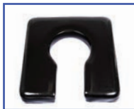
P60913* 18"Wx18"D Ensolite® 2" waterfall foam Front/Rear Open Seat A5.25"xB-8" opening