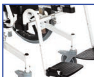
PR13725 Right Leg Rest