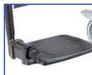
PR11099 Right Foot Plate