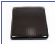
P61086 18"Wx18"D Ensolite® 2" foam Solid Seat