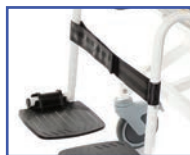
P60879 Calf Strap