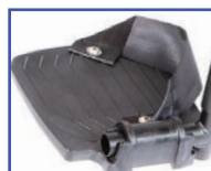
PL11100 Left Foot Plate with Heel Loop