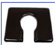
P60905 22"Wx18"D Ensolite® 1" foam Front/Rear Open Seat A-4.5"xB-7.75" opening