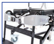
P11114 Bodypoint® Knee Belt