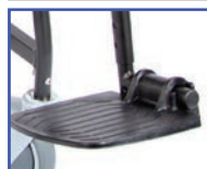
PL11099 Left Foot Plate