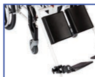
P13572 Right Elevating Leg Rest