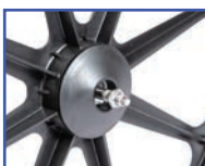
P13707 Quick Release Axles with Tipping Levers (pair)