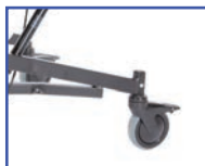
P13854 5" Dual Locking Casters (pair)