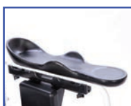
P13717 Left Hand with Arm Trough