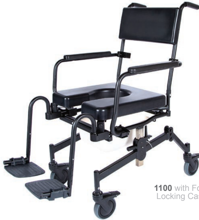
1100 with Four 5" Locking Casters