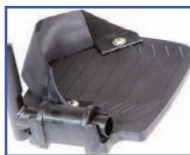
PR11100 Right Foot Plate with Heel Loop