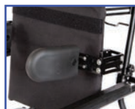
PL13574 Left Hand Swing-Away Adjustable Lateral