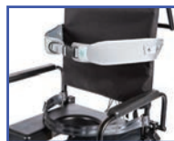
P11116 Bodypoint® Trunk Belt & Waist Belt