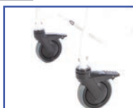
P60800-2 5" Dual Locking Casters (pair)