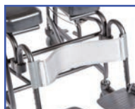
P61081 Bodypoint® Calf Strap