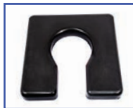
P60993* 18"Wx18"D Comfortuff 1.5" waterfall foam Front/Rear Open Seat A-5"xB-8" opening