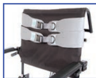
P11102 Bodypoint® Trunk Belt (pair)