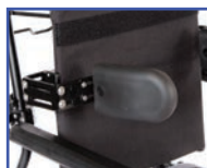
PR13574 Right Hand Swing-Away Adjustable Lateral