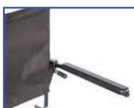
P13615 Left Hand Height-Adjustable Armrest