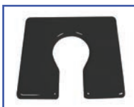
P60903 20"Wx18"D Ensolite® 1" foam Front/Rear Open Seat A-4.5"xB-7.75" opening