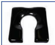
P61058 18"Wx18"D Ensolite® 2" waterfall foam Front Open Contoured Seat A-5.5"xB-8.25" opening