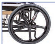
P13862 24" Wheels (pair)