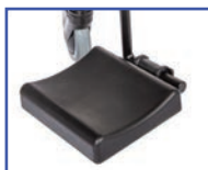
PL11101 Left Padded Foot Plate