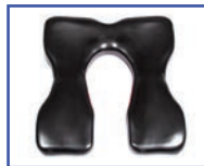
P60974 18"Wx18"D Comfortuff sloped foam Front Open Seat A-4"xB-6.5" opening