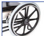
P13864 24" Pneumatic Street Tread Wheels (pair)