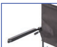
P13616 Right Hand Height-Adjustable Armrest