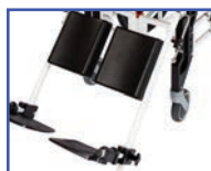
P13571 Left Elevating Leg Rest