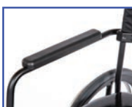
P13716 Right Hand Armrest with Pad