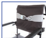
P11093 Bodypoint® Trunk Belt