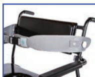
P11113 Bodypoint® Belt w/Quick Release Knobs