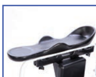
P13718 Right Hand with Arm Trough