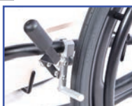
P13724 Wheel Locks with Offset Handle (pair)