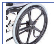
P13865 24" Flat Free Street Tread Wheels (pair)