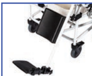
P13582 Left Elevating Leg Rest