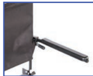
P13615 Left Hand Height-Adjustable Armrest