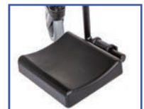
PL11101 Left Padded Foot Plate