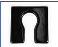
P11091 14"Wx14"D Ensolite® 1" foam Front/Rear Open Seat A-3.5"xB-5.5" opening