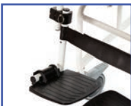
PR13610 Right Pediatric Leg Rest