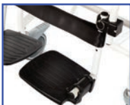
PL13610 Left Pediatric Leg Rest