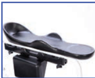
P13823 Left Hand Armrest with Arm Trough