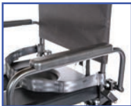
P13821 Left Hand Armrest with Pad