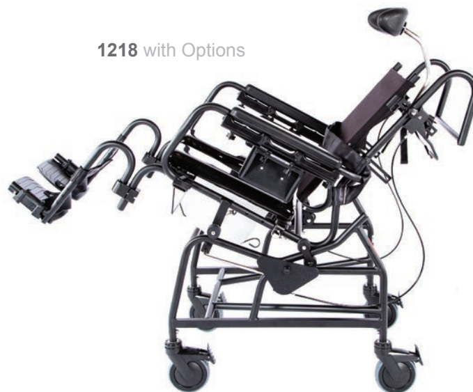
1218 with Options