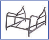
P13623 18"Wx18"D Frame