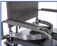
P13822 Right Hand Armrest with Pad