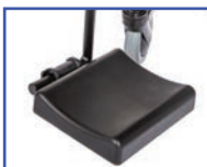
PR11101 Right Padded Foot Plate