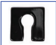
P11090 12"Wx12"D Ensolite® 1" foam Front/Rear Open Seat A-2.5"xB-4.5" opening