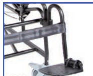
PL13581 Left Gooseneck Leg Rest