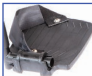
PR11100 Right Foot Plate with Heel Loop