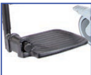
PR11099 Right Foot Plate