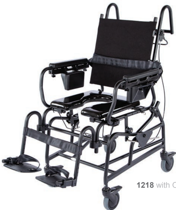
1218 with Options