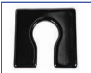
P11092 16"Wx16"D Ensolite® 1" foam Front/Rear Open Seat A-4"xB-6.5" opening