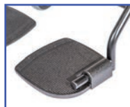
P13891 Left Oversized Aluminum Foot Plate