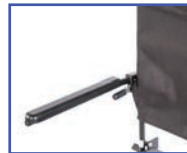
P13616 Right Hand Height-Adjustable Armrest