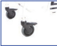
P13770 5" Casters (pair) and 5" Dual Locking Casters (pair)