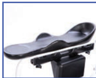
P13824 Right Hand Armrest with Arm Trough