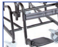
PR13581 Right Gooseneck Leg Rest