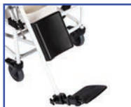
P13583 Right Elevating Leg Rest