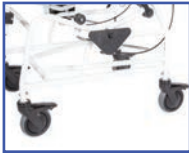
P60800-4 5" Dual Locking Casters (2 pair)