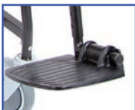
PL11099 Left Foot Plate