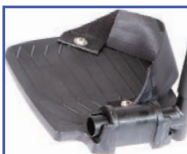
PL11100 Left Foot Plate with Heel Loop