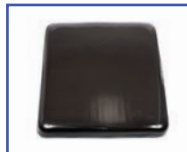
P13617 18"Wx18"D Ensolite® 2" foam Solid Seat

Weight Capacity for Seats 12"Wx12"D - 150lbs. (68kg) 14"Wx14"D - 250lbs. (113kg) 16"Wx16"D - 300lbs. (136kg) 18"Wx18"D - 350lbs. (158kg)