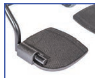
P13892 Right Oversized Aluminum Foot Plate